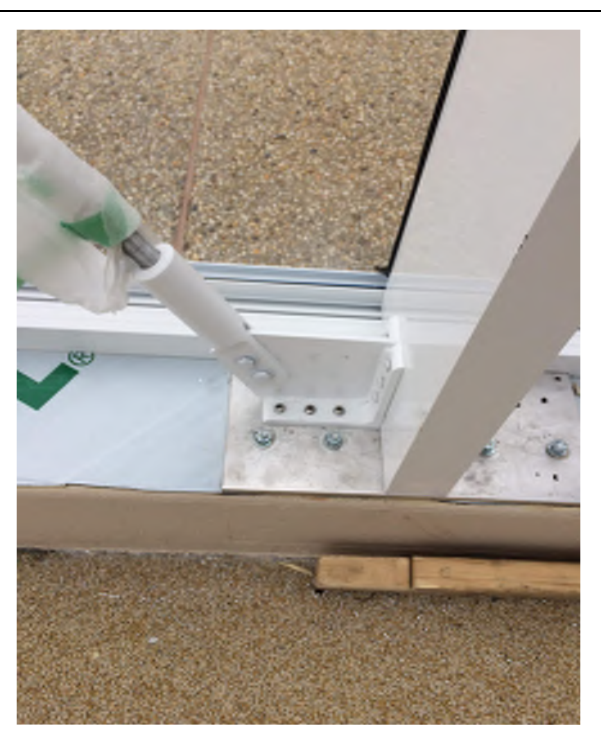
Threaded Rod Cross Brace Typ.