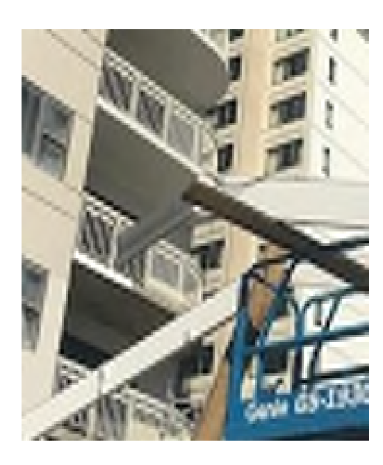
Internal Connection Plates