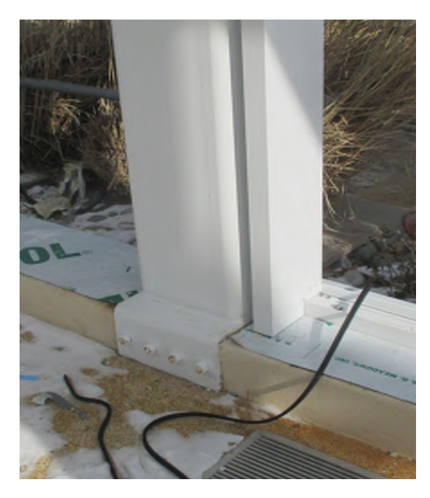
Saddle Type Base Plate and Side by Side Double Moment Frames