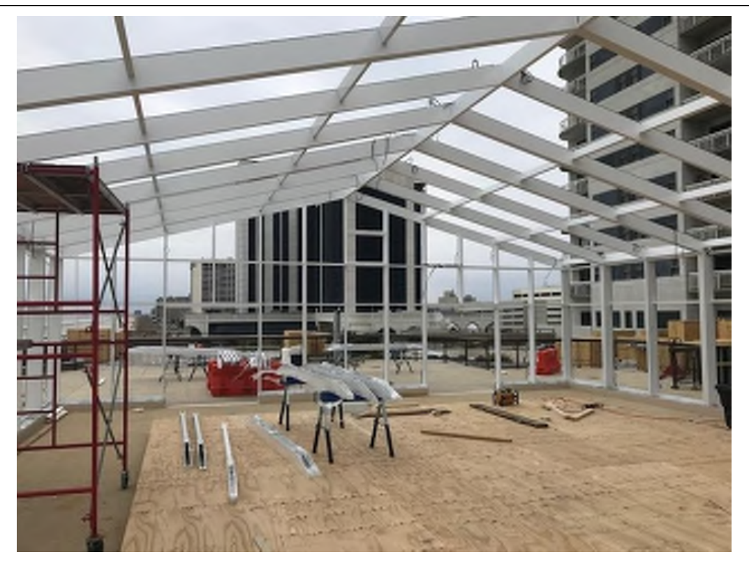
Aluminum Moment Frames