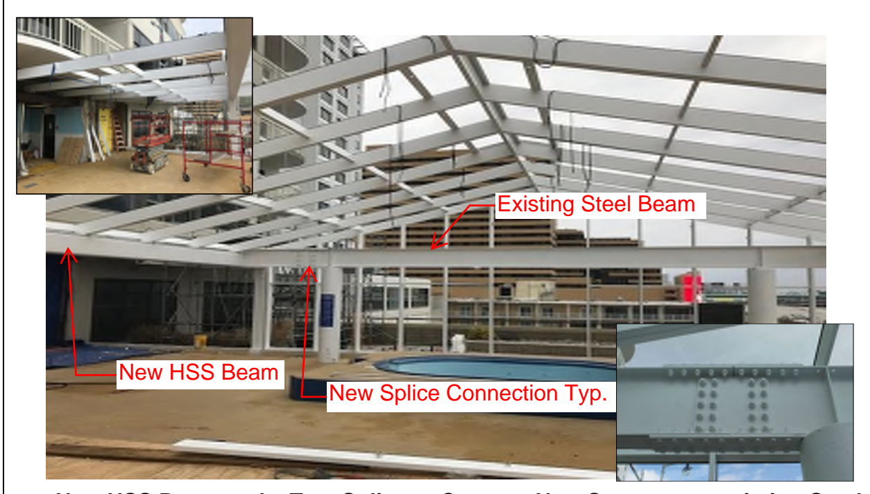
New HSS Beam and a Typ. Splice to Connect New Structure to existing Steel Beams.