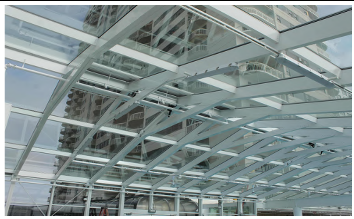
Ridge Vent, Collar Tie & Connection, Double and Single Moment Frames