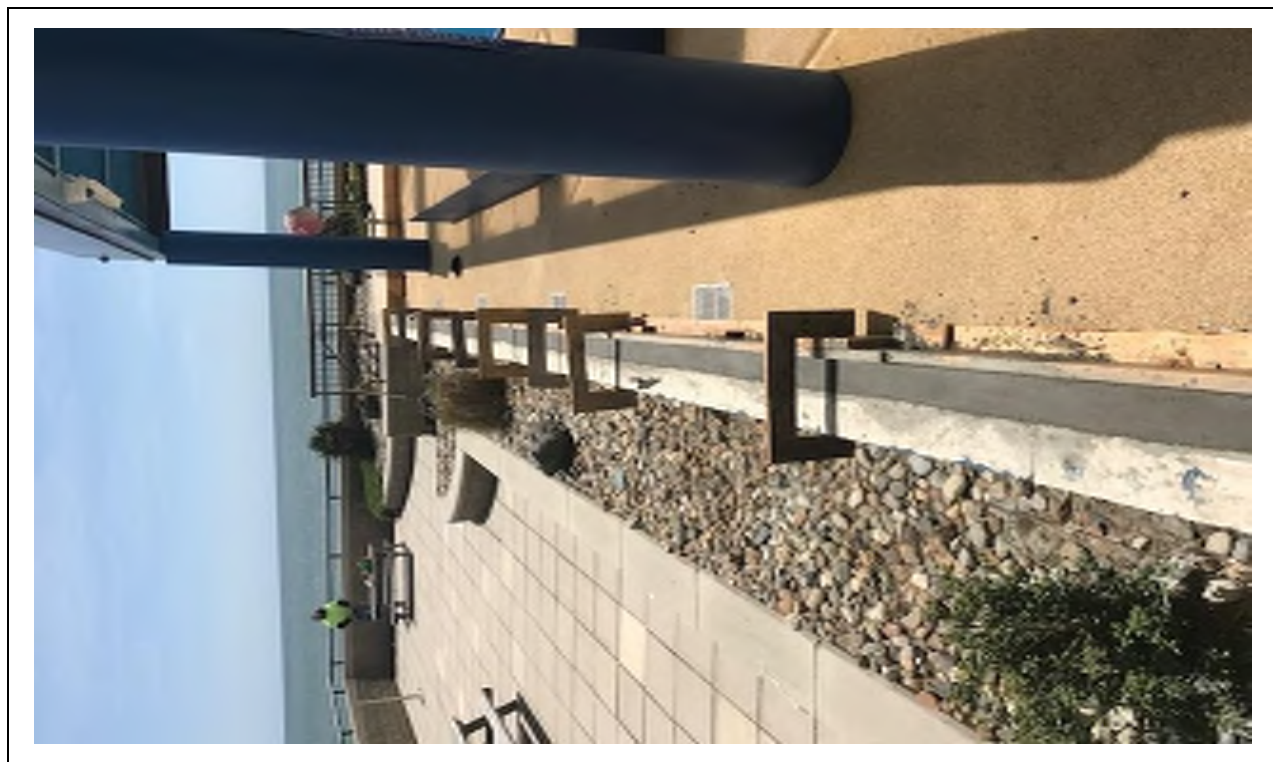
Modification of Existing Curb to Receive New Enclosure