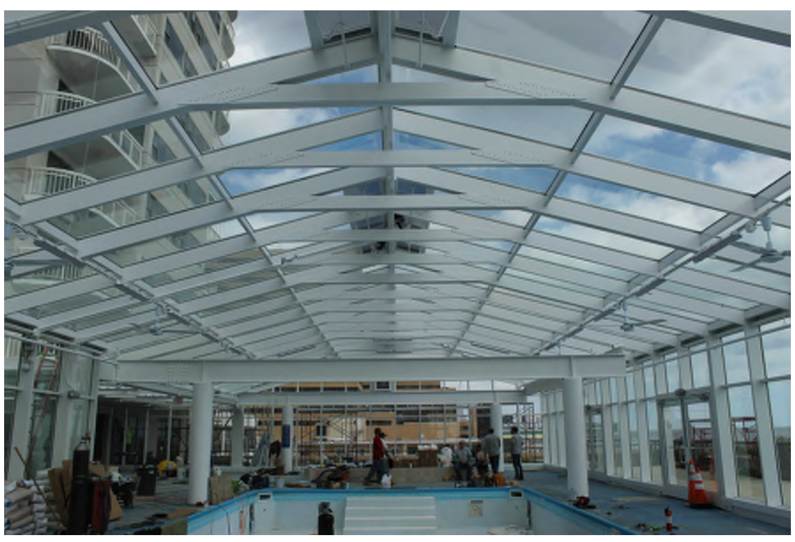
Overview of the Entire Enclosure Structure